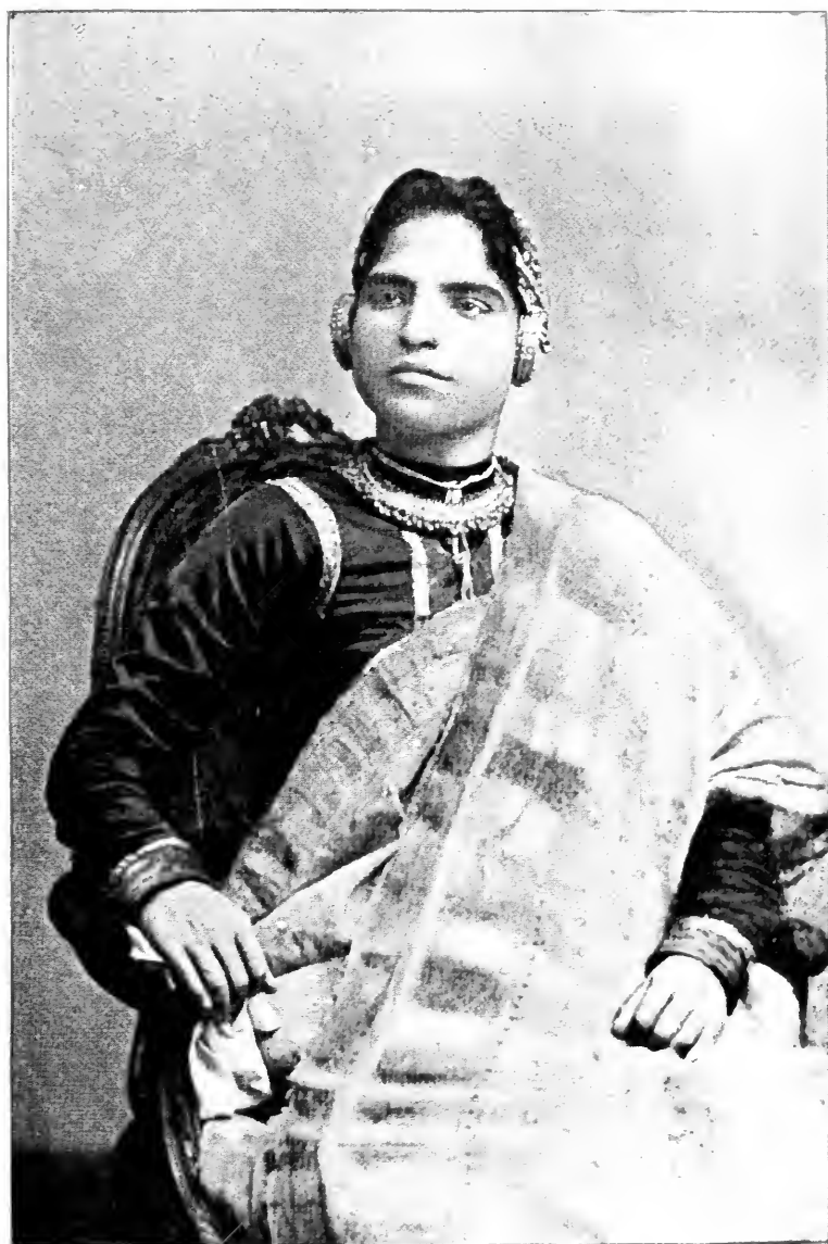
MOHAMEDAN NATCH GIRL